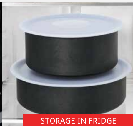
STORAGE IN FRIDGE