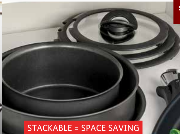
STACKABLE = SPACE SAVING