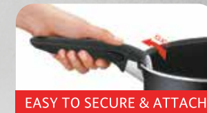
EASY TO SECURE & ATTACH

Simply press the two side buttons simultaneously.