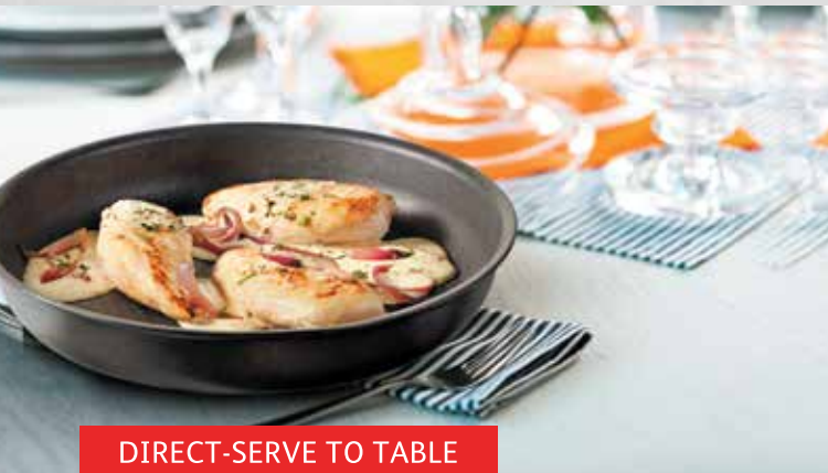
DIRECT-SERVE TO TABLE